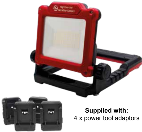
Supplied with: 4 x power tool adaptors